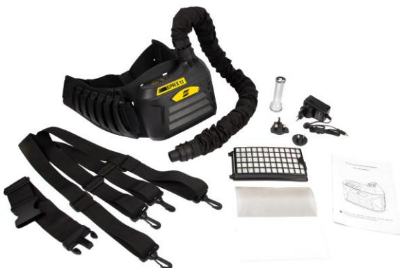
EPR-X1.1 PAPP System