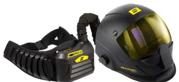
EPR-X1.1 with Sentinel A60 Air Helmet